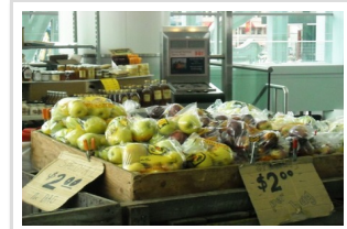
Staten Island Ferry Whitehall Terminal Greenmarket