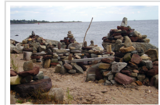
Mt. Loretto Unique Area