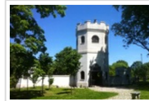
Staten Island Botanical Garden